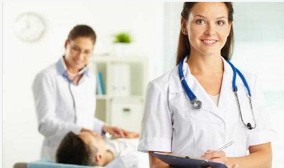
HemorrhoidsInternal HemorrhoidsHemorrhoidExternal HemorrhoidsNatural